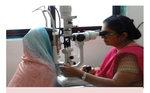
Ophthalmic Services provided twice a month is used by 69 patients since its start in Sept'14