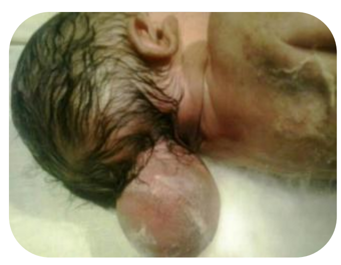
The project had two main specific objectives:

local doctors on emergency obstetric care and life saving anesthesia skills. 8 health facilities from 8 district were selected for this pilot project {7 District hospitals & 1 SDH - Samastipur, Bettiah,